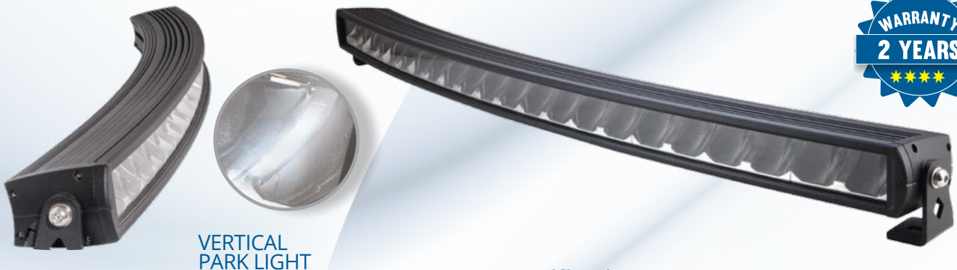
VERTICAL PARK LIGHT