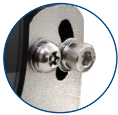
Security Lock Nut