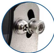
Security Lock Nut